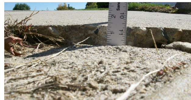
An example of excessive sidewalk projection

If you do not inform the Township of your desire to complete the work yourself and it is not completed in the allotted time, Shelby township will automatically have the work completed under the township's