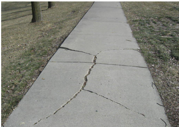
An example of excessive cracking

The orange and green lines are an indication that there is work that needs to be completed on the affected sidewalk. Orange lines indicate the owner's responsibility to complete the work; green lines indicate the work required is the Township's responsibility and will be completed at no cost to you.